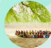
EKJUT (Together Building Healthier Communities)

Plot no. - 556B, Potka Chakradharpur, West Singhbhum, Pin - 833102, Jharkhand, India.